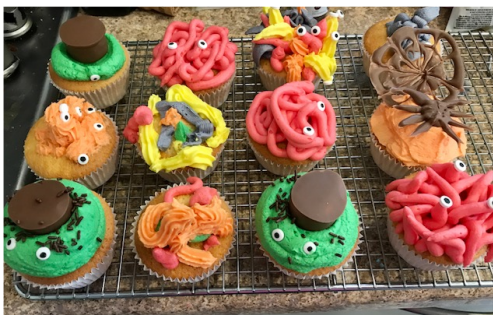
Myles from room 18 made some spooky cupcakes