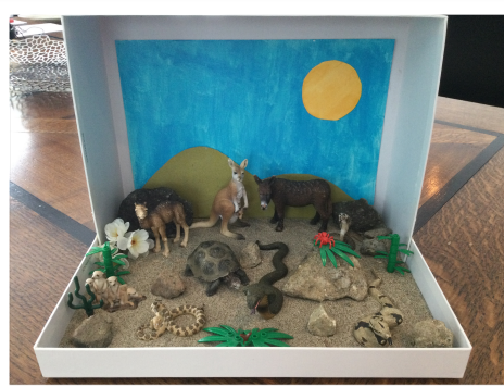
Desert ecosystem diorama by Marius in room 7