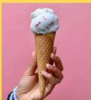
LALELE ORGANIC GELATO