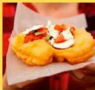
LANGOS FRIED BREAD PUFFS